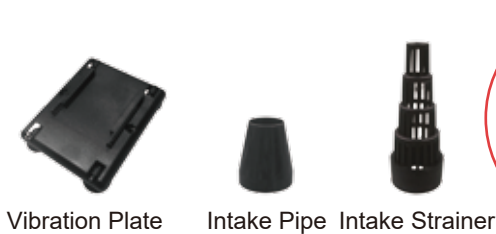
Vibration Plate Intake Pipe Intake Strainer